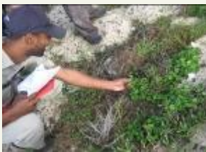
Evaluation of the dunes

This project was created to lay out a foundation and to find the eco-tourism potential for the nature reserves in the Western Cape