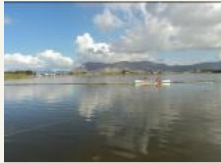
GPVCA: Hyacinth Clearing Team