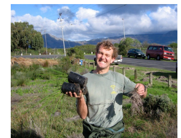
Clearing of Von Blommenstein Park