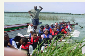
Grand west Sponsored camps