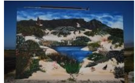
Bird information Centre Mural.

Treatment Works (CFWWTW) for habitats for birds, particularly water birds, as well as providing jobs and training (if funds are available) to members of the local communities.