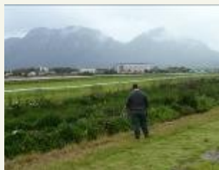
2011 Pre & Post Burn Kenilworth

the Wildlife and Environmental Society of South Africa (WESSA).