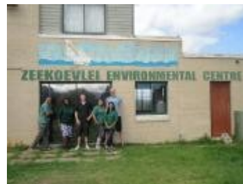
Phase two: Zeep

The Young Professionals Programme is run by the Table Mountain Fund.