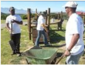
Volunteers building a braai

The first 3 years as a pilot project in the Environmental Resource Management Department, the Project will be called “Wolfgat / Macassar Dunes Nature Reserve Eco-Tourism Project”.