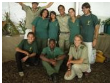
Phase one: KRCA