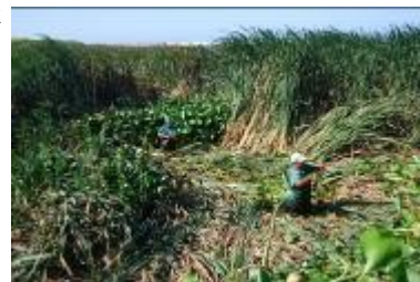
Birding Platform & staff removing water hyacinth