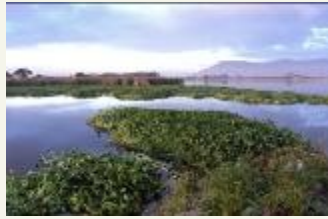
GPVCA: Before Clearing

These small urban wetlands are surrounded by the suburbs of Grassy Park, Southfield, Heathfield and Retreat on the Cape Flats. Vegetation types include Cape Lowland Freshwater Wetlands, Cape Flats Dune Strandveld from False Bay