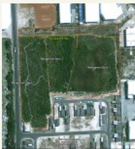
Aerial photograph: Soralia Park