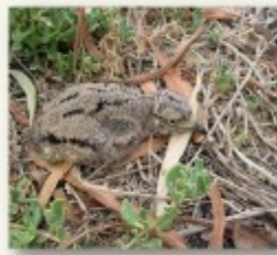
Water Thick-knee ( Burhinus vermiculatus )

Each site has biodiversity importance, such as, Soralia Park, which was named after the endangered