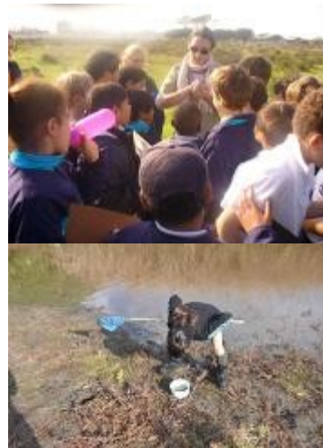
Environmental Education at SSS.

CTEET has been a great support, assisting with staff provisioning from fellow projects and guidance from colleagues.