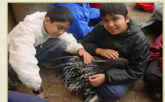
Learners engaging with “Pippa” the porcupine.