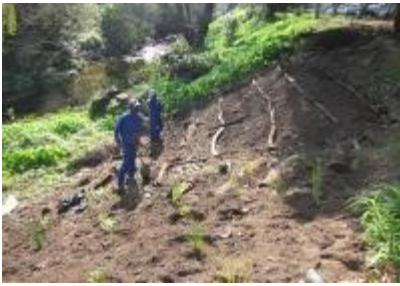
Liesbeek Maintenance team stabilising the river banks

The Liesbeek is an important historical and ecological river that runs from its source, on the eastern slopes of Table Mountain, through nine suburbs until it joins the Black River at Raapenberg and enters the