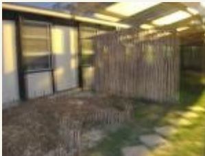
Ecotourism facility (braai area)