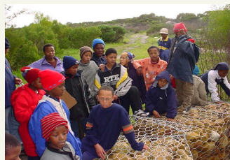
CoCT Sponsored camps