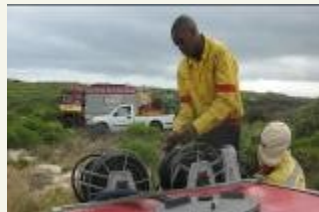
2008 Kogelberg Mountain fire