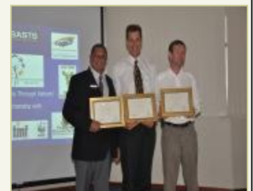
Board of Trustees

The evening was a reminder that anything is possible through working together.