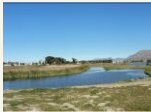
GPVCA: After Clearing

(endangered) and Cape Flats Sand Fynbos (critically endangered).